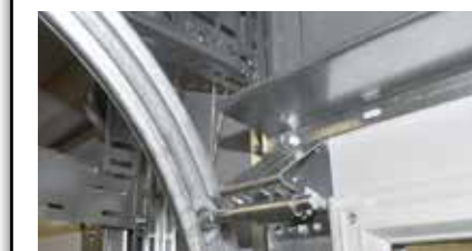
14 Ga Top Bracket