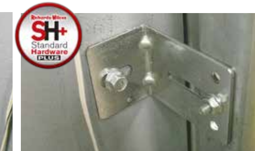
Adjustable Bolted Brackets on Standard Hardware PLUS Set