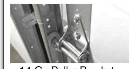
14 Ga Roller Bracket