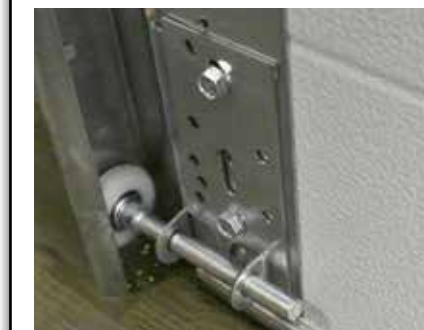
13 Ga Bottom Bracket