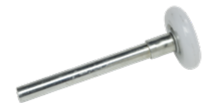
10-ball bearing white nylon rollers on zinc plated stem (Industry Norm: Either Steel or Plastic)