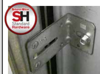
Riveted Track Brackets on Standard Hardware Set